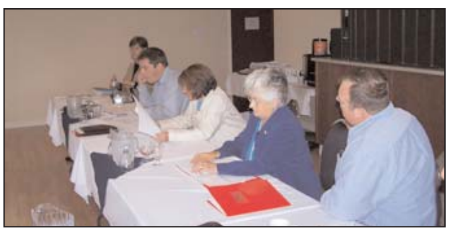
Over 40 participants attended the Campground workshops in 2005 that took place in Deer Lake, Gander and Bay Roberts.

In order to capitalize on new trends in travel planning and improve industry competitiveness, the "bootcamp", a comprehensive two-day program, offered valuable information to tourism operators about website design, development, search engine ranking, Internet marketing strategy development,